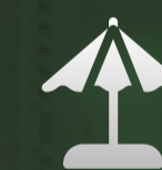
LA MER BEACH