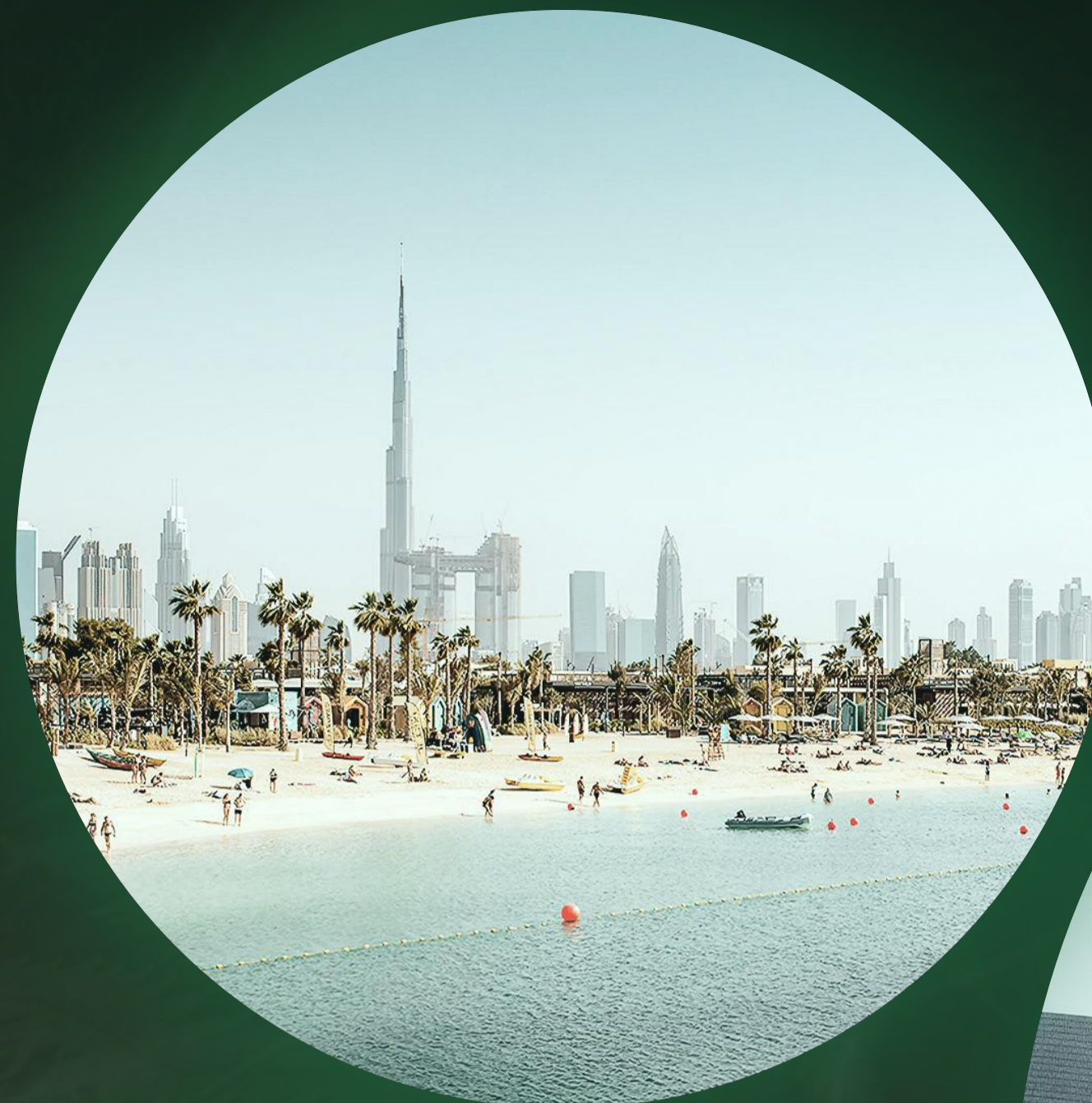
LA MER BEACH